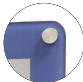
1" Round Corner