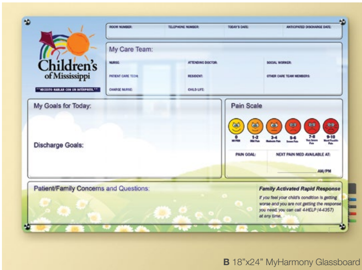
B 18"x24" MyHarmony Glassboard