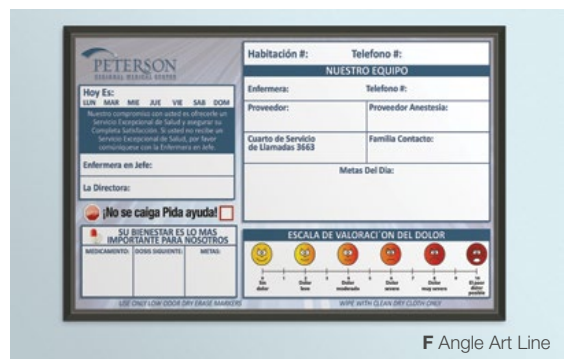
F Angle Art Line