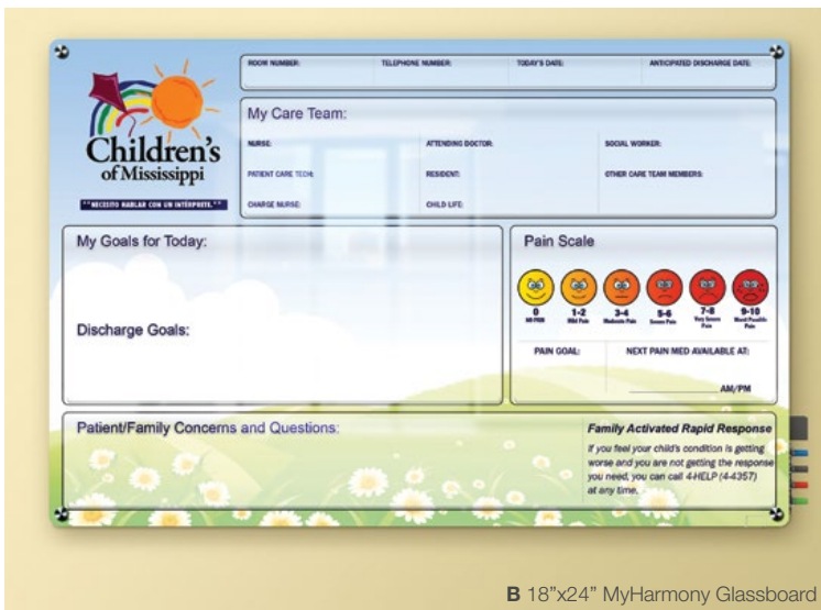
B 18"x24" MyHarmony Glassboard