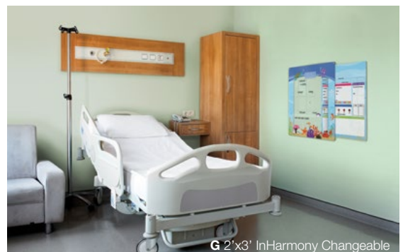
G 2'x3' InHarmony Changeable