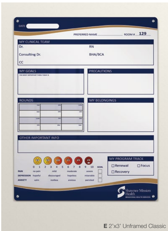
E 2'x3' Unframed Classic