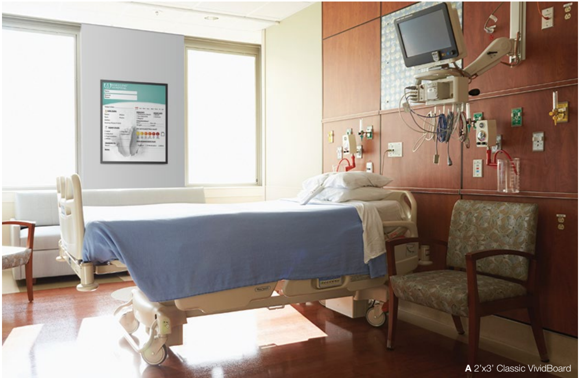
A 2'x3' Classic VividBoard