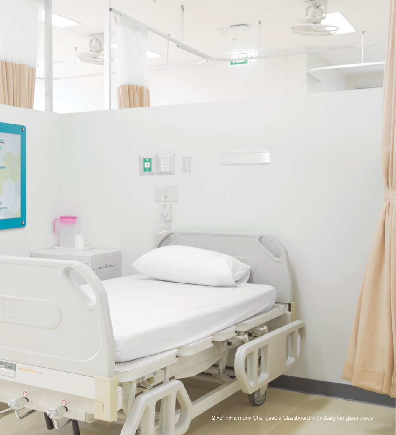
2'x3' InHarmony Changeable Glassboard with designed glass border